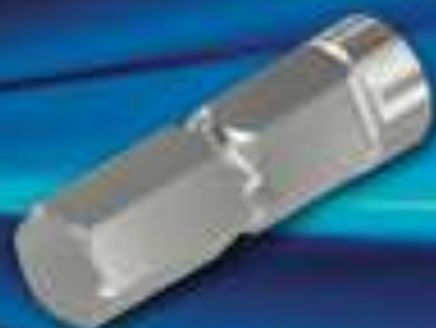
Hex Drive (mm)