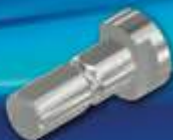
Jacob-Hall or Zimmer-Hall