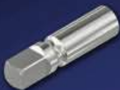
3/16" or 1/4" Square Quicklock