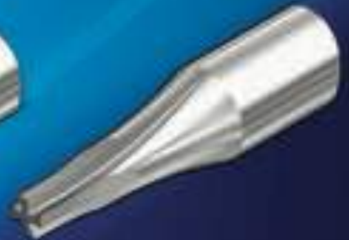
Torque Plus Drive