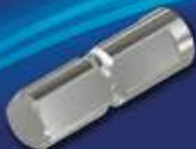
Tri-Flat or Tri-Lobe